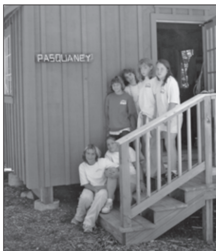
The "Pasquaney girls" love their new dorm and the new Circle camp.